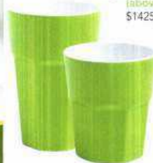
[left] JAB Melamine 410ml Tumbler, $6.99 and 500ml Tumbler, $7.50, Tomkin.