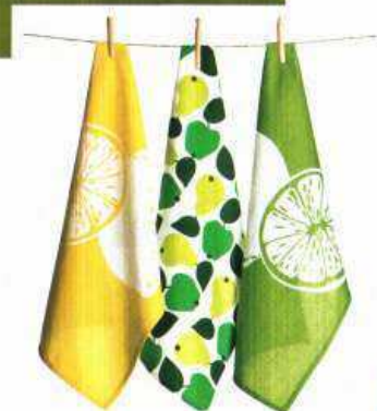
Morgan & Finch citrus tea towels, $6.95 each, Bed Bath 'N' Table.