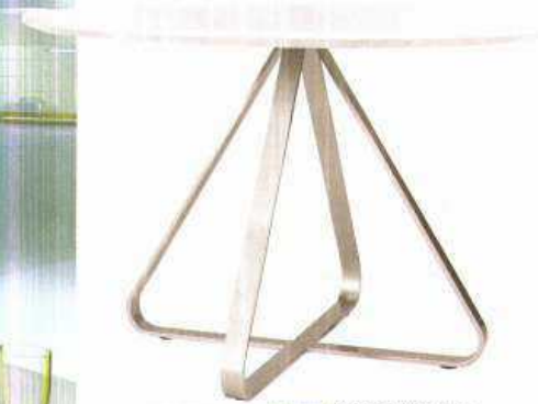
[above] Arosa dining table, $1425, Globe West.

Add some zest to your kitchen with fresh lime accents. Start with some funky and bright lime green accessories and slowly build on the look. Whether it's an interesting light fixture or a colourful tiled splashback, a little goes a long way!