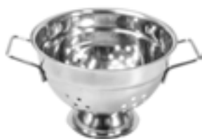
COLANDER - 18/10