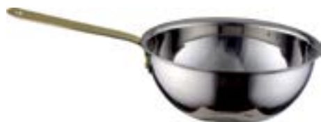
WOK - 18/10 WITH BRASS HANDLE