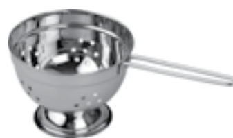
COLANDER - W/LONG HANDLE 18/10