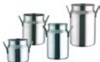
MILK/SAUCE SERVING CHURN - 18/10