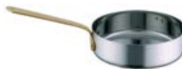
FRYPAN - 18/10 WITH BRASS HANDLE