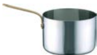
SAUCEPAN - 18/10 WITH BRASS HANDLE