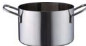
CASSEROLE - 18/10 WITH S/S HANDLE