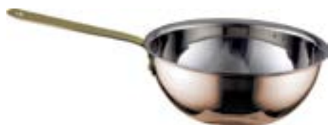
WOK - COPPER WITH BRASS HANDLE