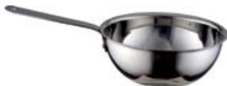
WOK - 18/10 WITH S/S HANDLE