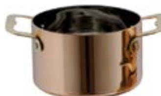
CASSEROLE - COPPER WITH BRASS HANDLE