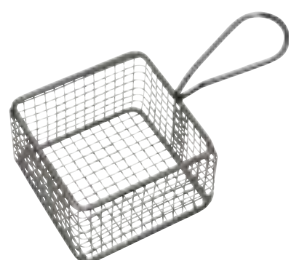
SQUARE WIRE BASKET WITH HANDLE