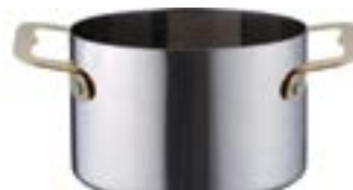
CASSEROLE - 18/10 WITH BRASS HANDLE