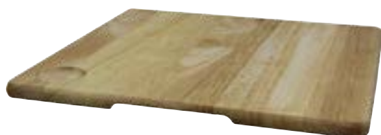
WOODEN SERVING BOARD W/45mm well