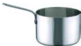
SAUCEPAN - 18/10 WITH S/S HANDLE