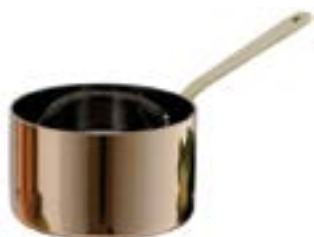
SAUCEPAN - COPPER WITH BRASS HANDLE