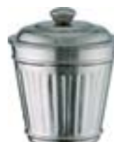
TRASH CAN RIBBED - 18/10