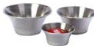
FLARED SAUCE CUP