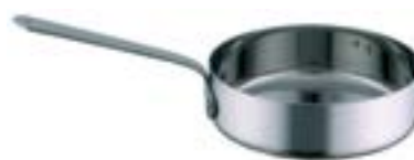
FRYPAN - 18/10 WITH S/S HANDLE