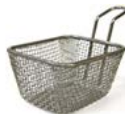
RECTANGULAR WIRE BASKET WITH HANDLE