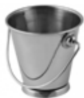
MINI SERVING PAIL WITH FOOT