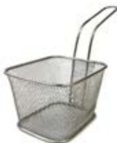
RECTANGULAR WIRE BASKET WITH HANDLE