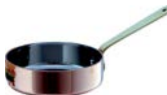
FRYPAN - COPPER WITH BRASS HANDLE