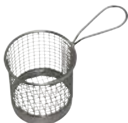
ROUND WIRE BASKET WITH HANDLE