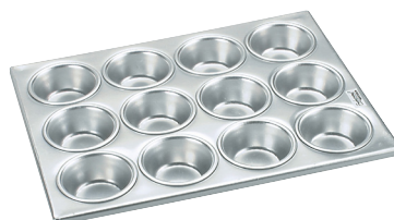
12 cup Aluminium muffin pan