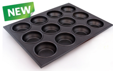
12 cup non-stick muffin pan